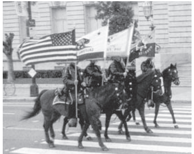
2007 Veteran's Day Parade