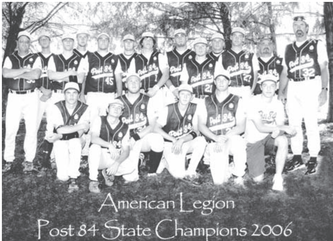
2006 Champions - Merced CA Team