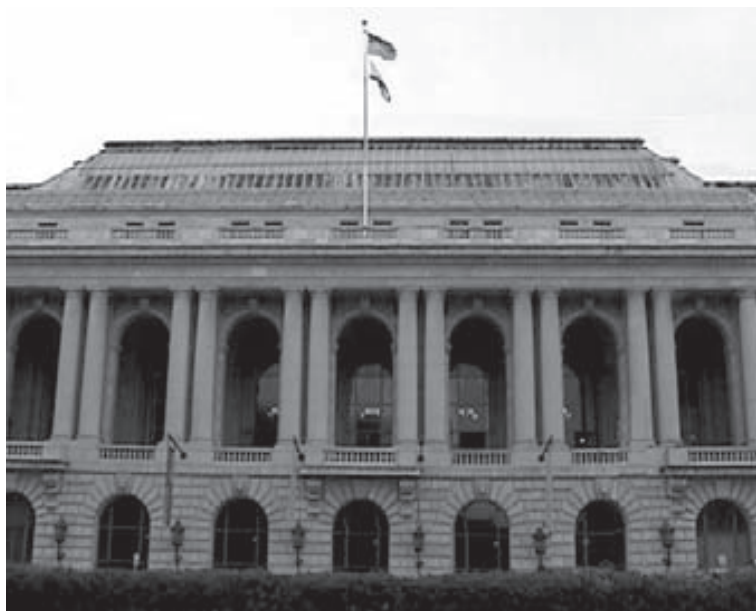
War Memorial Building, 401 Van Ness, San Francisco