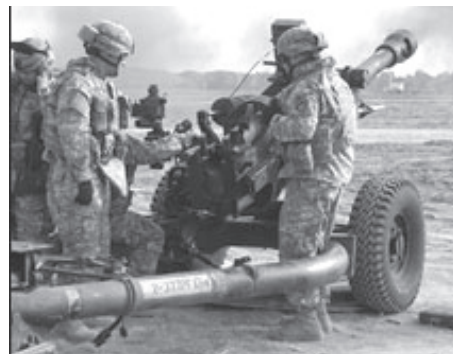
Soldiers send a 105 mm howitzer round downrange during a fire mission Kalsu, Iraq.

Thank you for allowing me to serve you, and to have the honor of being a part of the largest and greatest Veterans organization, The American Legion.