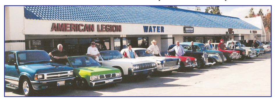
Members of Post 755's new car club, the Charter Cove Cruisers, show off their classic cars in front of the Post Home. Nearly 50 car enthusiasts are now also proud members of Post 755, Unit 755 or Squadron 755.

Anyone interested in joining Charter Cove Post 755's car club is invited to contact Ray Bradshaw at (626) 848-8740. He also has information about how you can start your own car club at your own Post.