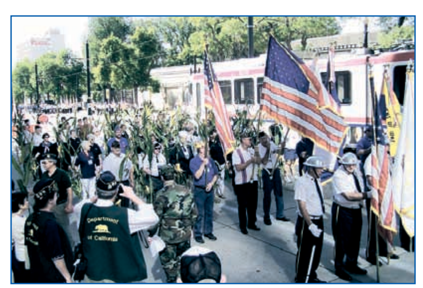
The Department of Iowa.