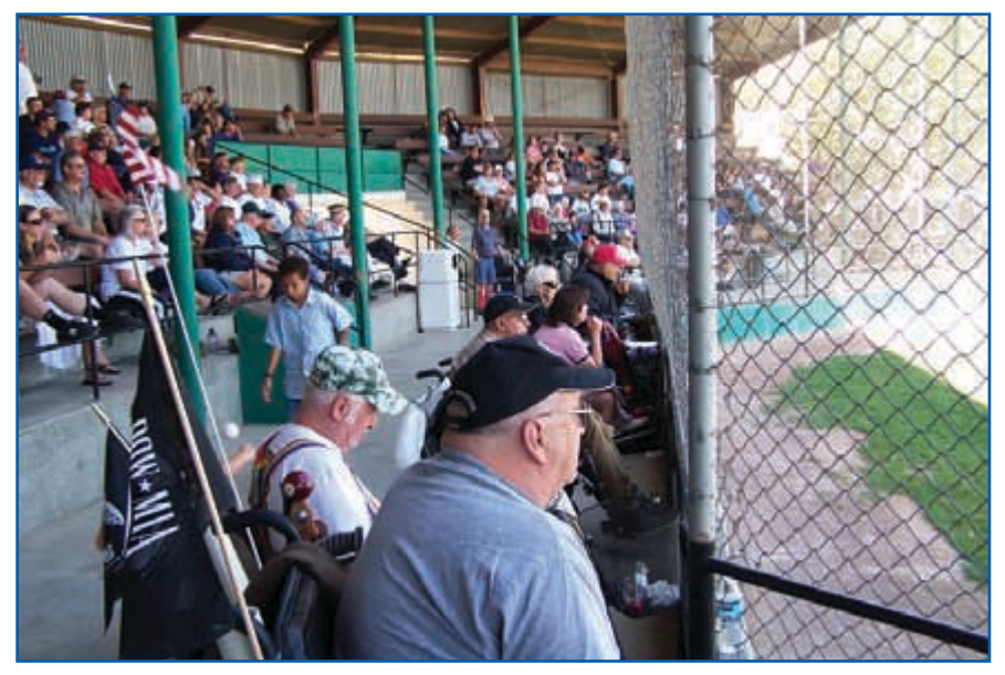
Legion Days at Yountville Veterans Home, Yountville, CA.