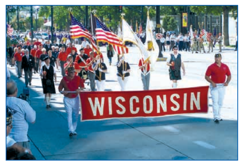
The Department of Wisconsin.