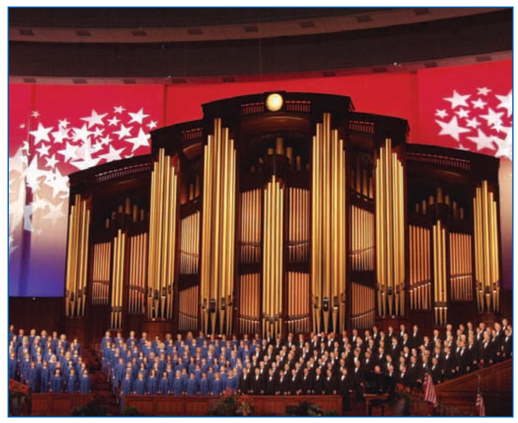
Morman Tabernacle Choir during the Memorial Service for National Convention Delegates in the new LDS Conference Center in Salt Lake City, Utah.