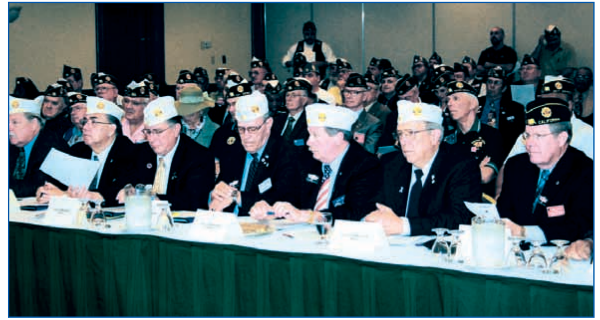
Newly elected Vice Commanders attend their first DEC in Visalia, CA.