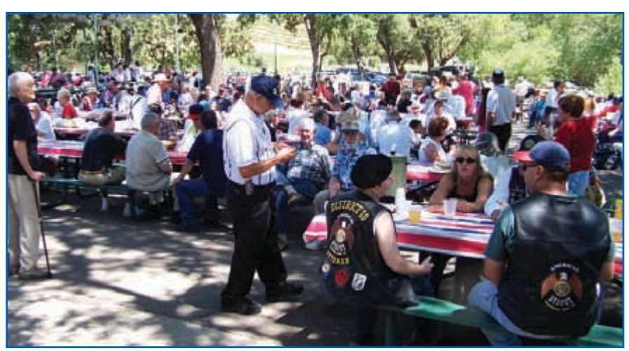
Legion Days at Yountville Veterans Home, Yountville, CA.