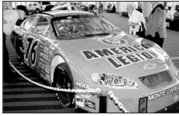
The American Legion NASCAR.