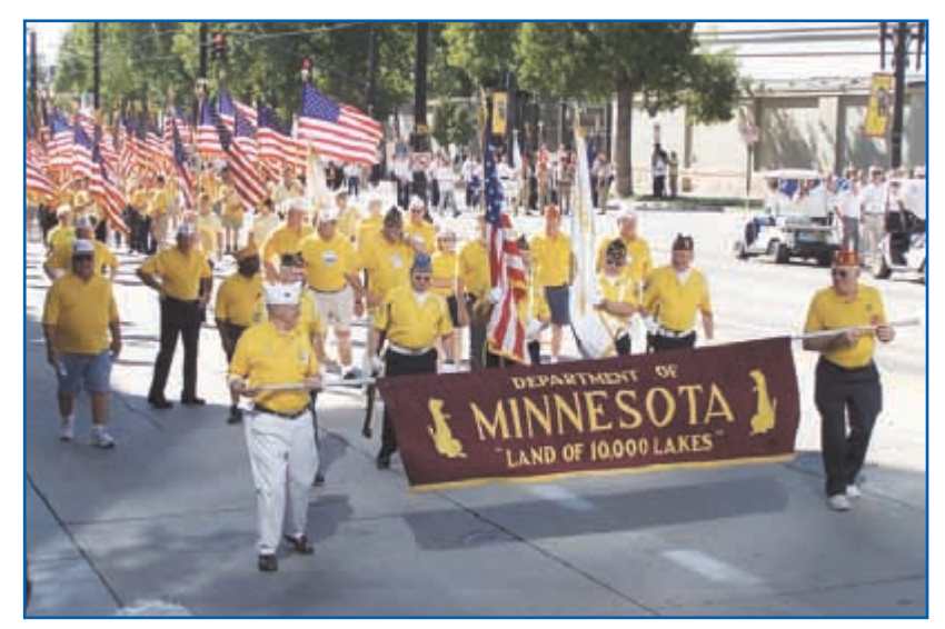
The Department of Minnesota.