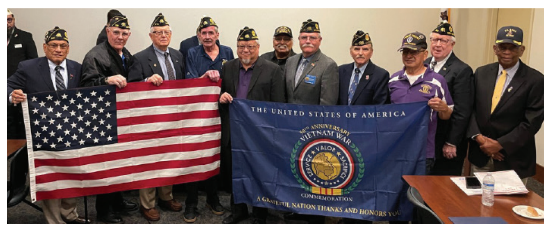
By Nestor Aliga Post 603

On April 19, The American Legion Department of California successfully hosted its Annual Legislative Day in Sacramento at the March Fong Eu Secretary of State Building.