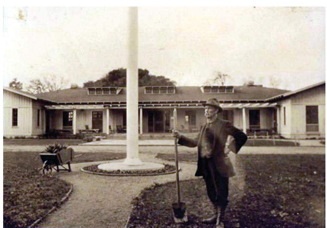
The Hostess House as it was prior to the Memorial Flagpole's installation. The flagpole seen here was donated by The American Legion sometime after World War I and before 1930.

Over two years ago, alleged copper thieves damaged the base of the Memorial Flagpole, sparking Stanford University officials to remove four plaques commemorating Veterans of the Grand Army of the Republic — Union soldiers who served during the American Civil War — as well as the Native Sons of the Golden West,