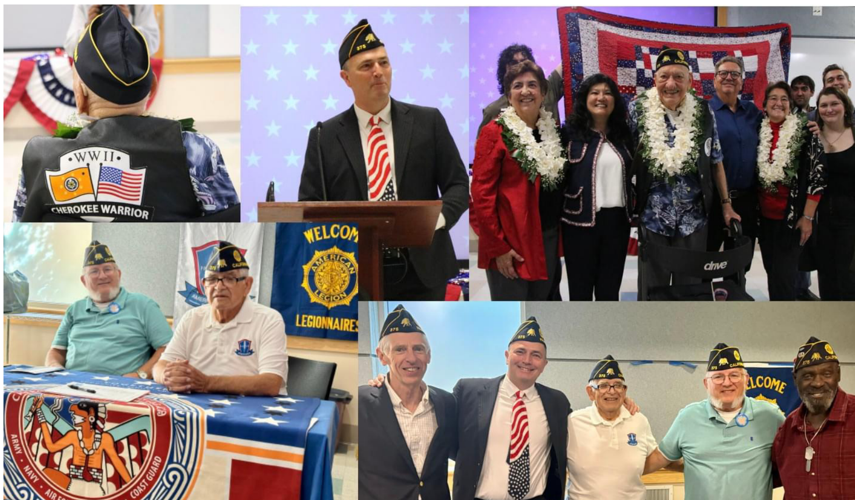
Members of American Legion Palo Alto Post 375.