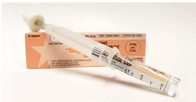
Single dose injectable Naloxone