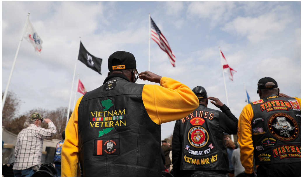
Vietnam Veterans salute during a 10th annual Vietnam Veterans Day Celebration hosted by the Vietnam Veterans of America Chapter 1067

This issue comes as the VA faces growing pressure due to the recently passed PACT Act, which