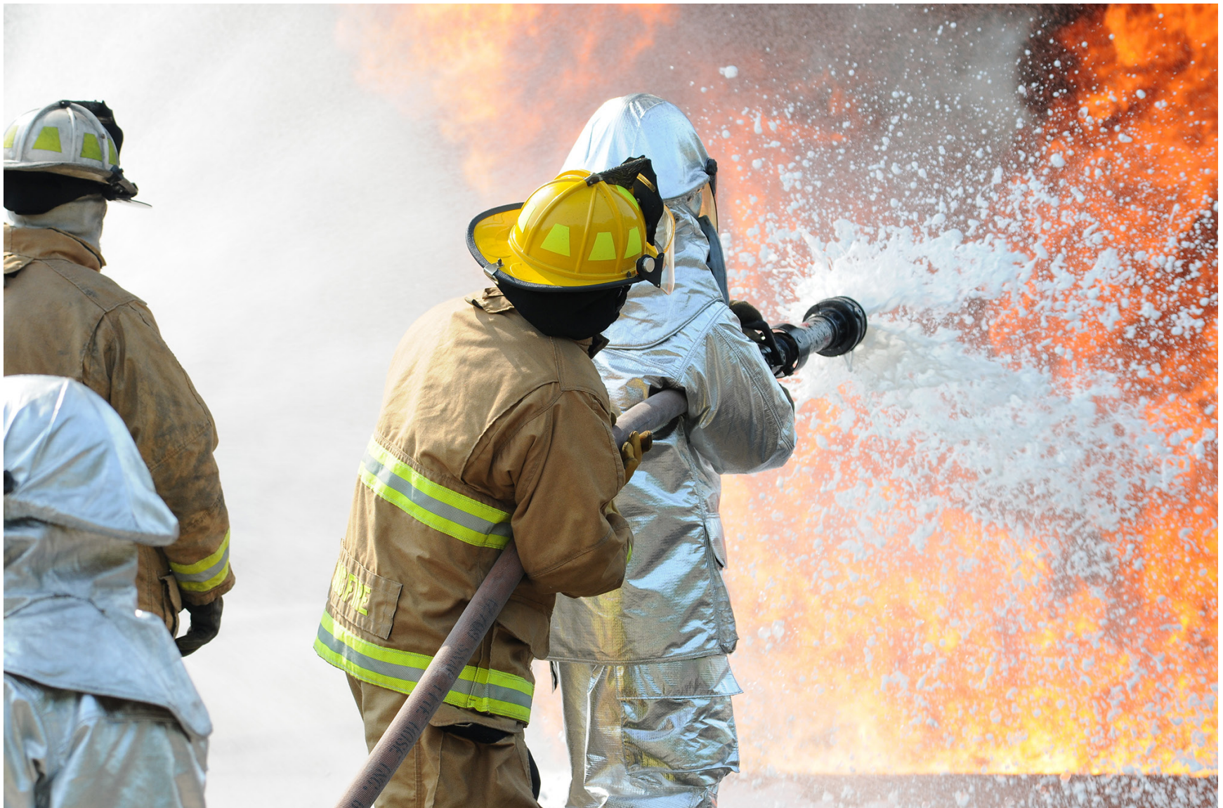
Air National Guard's 177th Fighter Wing battle a simulated aircraft fire with Aqueous Film Forming Foam.