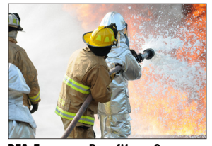
PFA Exposure Benefits, p.8