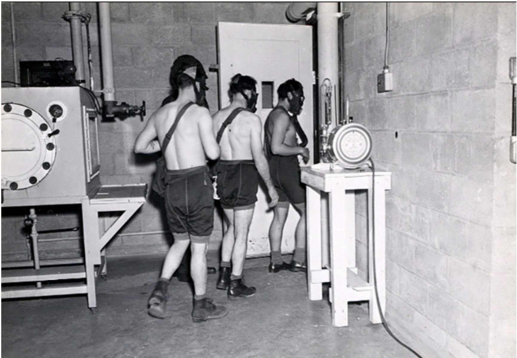
March 1945 Mustard Gas Tests – Edgewood Arsenal Subjects